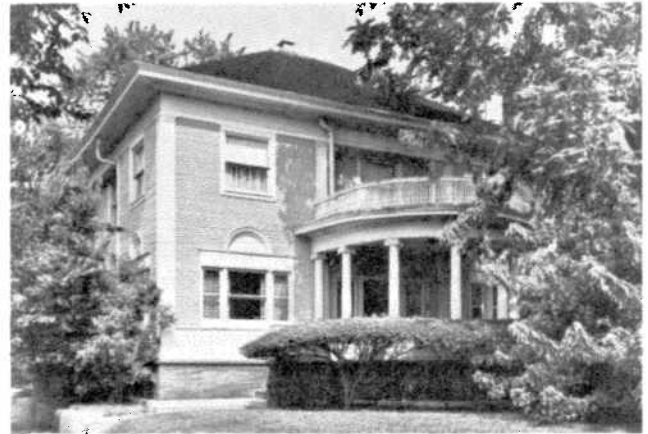
The Blossom House ( above) was designed by Wright in 1892 in the Colonial revival style. Fifteen years later, Wright designed a carriage house ( below) for the Blossoms in the Prairie style that he had developed during the previous decade.

boarding interrupted by flat Doric pilasters. Although these elements of the facade are traditional, there is a horizontal quality to the Blossom House that is unlike other Colonial revival houses. A marked horizontality would later become a primary feature of Wright's work.